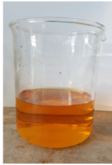
Beaker with iodine and water