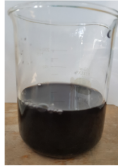
Beaker with iodine, water and starch (cornstarch) mixed.